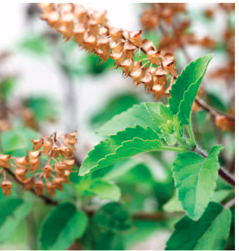
Top: Capsules containing powdered Açai, Euterpe oleracea. Bottom: Tulsi, or holy basil, Ocimum tenuiflorum