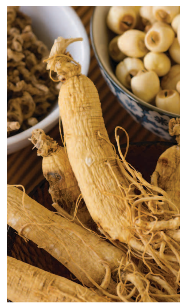
Korean ginseng, Panax ginseng

Providing legal certainty and effective and streamlined measures - Companies wishing to explore novel ingredients for the botanicals sector have been faced with an uncertain legal climate, and confusion about where to go for decision-making about ABS agreements. The Nagoya Protocol recognizes this concern and seeks to create an environment of legal certainty and mutual trust by requiring Parties to designate a national focal point on ABS and one or more competent national authorities to grant access. ABS national focal points are required to make information available on procedures for obtaining prior informed consent and reaching mutually agreed terms (Article 13). Establishment of an ABS Clearing-House (Article 14) for sharing information will also help to achieve this goal. The development of model contractual clauses (Article 19) can provide additional legal certainty and clarity and reduce transaction costs.