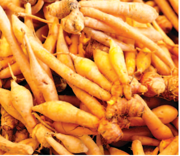
Top: Extracting Aloe vera sap. Bottom: Ginger, Zingiber officinale

associated with genetic resources. In addition, as further clarified by the Protocol (Article 2(c)), "utilization of genetic resources" means to conduct research and development on the genetic and/or biochemical composition of genetic resources, including through the application of biotechnology as defined in Article 2 of the Convention." Implementation of the Protocol within countries can further help to clarify and resolve the issue of scope.