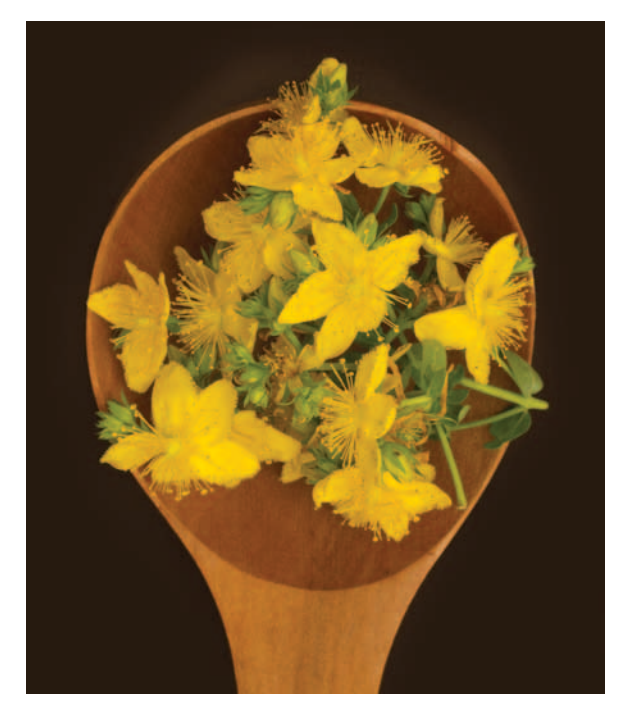
St John's Wort, Hypericum perforatum

Consumer awareness of green and fair trade issues associated with botanicals has grown over the last ten years, and it is difficult today to find a product without these claims attached to it. 30 Certification and labelling programs in this sector include organic (e.g. Soil Association, Ecocert), fair trade (Fair for Life, FairTrade, FairWild), and sustainable wild harvested (FairWild). In practice, however, very few companies have close relationships with their sources, and most rely on the claims of layers of intermediaries. Some companies even develop their own watered-down labeling schemes. The result is that consumers are overwhelmed and cannot differentiate between reputable and false claims. As one US industry representative put it: "who has the time to drill down and figure out each label?" This was echoed by a European industry analyst: "Most of all, these programs are confusing for the consumer - what is truth and what is invented - no one has any idea."