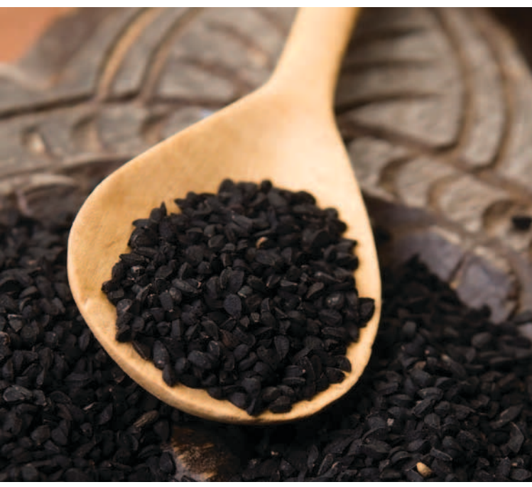
Top: Candelabra. Bottom: Nigella seeds.