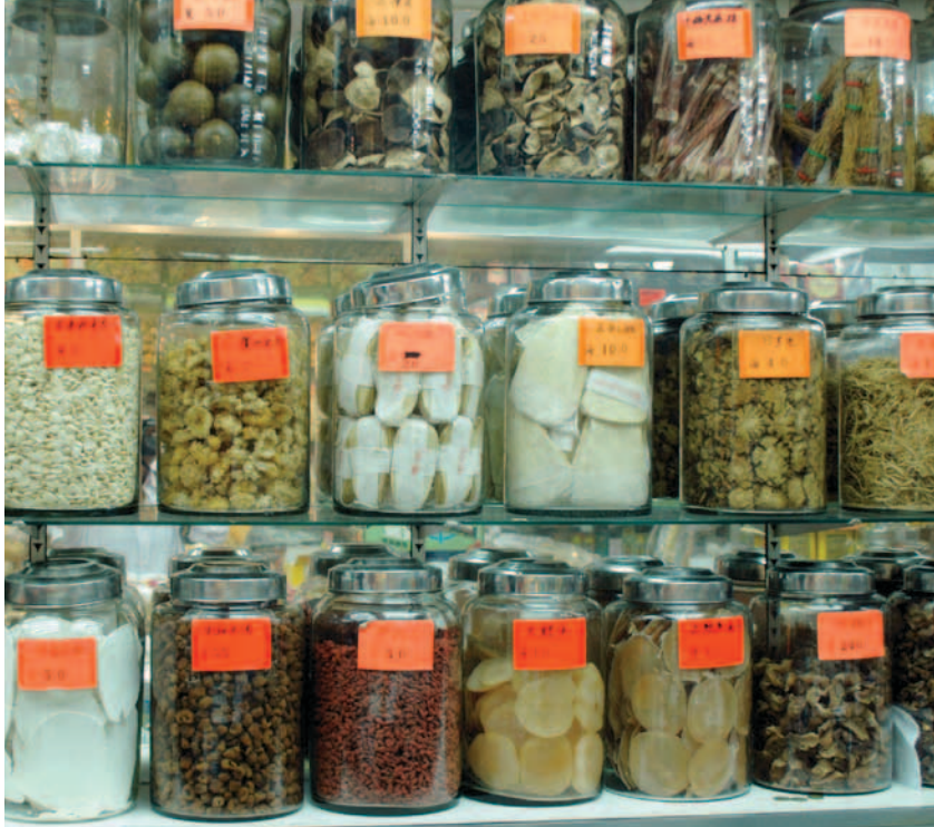
Plants used in Traditional Chinese Medicine.

in marketing products to consumers by validating claims for safety and efficacy. Traditional knowledge also plays a role in selecting and breeding, or wild-harvesting, plants with particular properties, including maximizing yields of active constituents.<sup>28</sup>